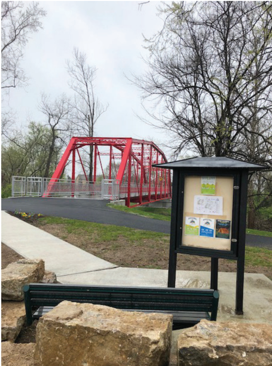
Figure 8: Columbus People Trail at Hamilton Center