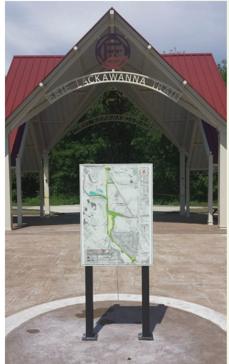
Figure 1: Trailhead Shelter on the Erie Lackawanna Trail