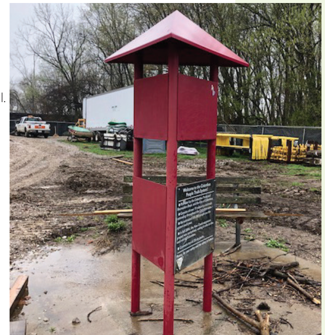
Figure 10: Trailhead Under Construction on the Columbus People Trail

The impact of trails on active living is confirmed in Table 36 which shows a self-reported significant increase in the amount of exercise among trail users. Sixty-seven percent of trail users indicated an increase in their activity levels since beginning to use a trail, with 71% of respondents indicating that their level of activity increased by more than 25%. The largest average increase in exercise levels, 36%, was seen in Bloomington. All trails showed an average increase in exercise levels of at least 25% by people who exercise more now than they did before they access to the trail.