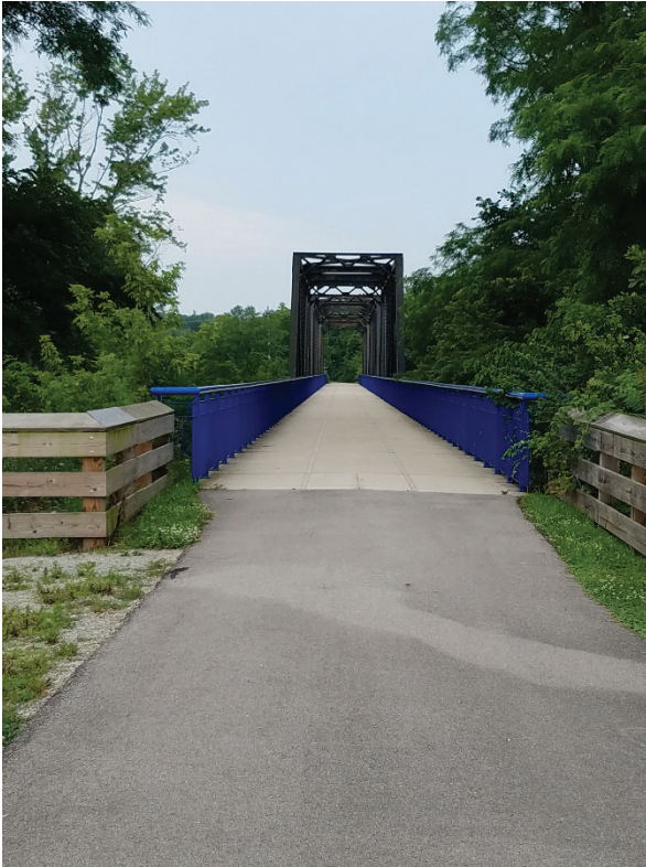
Figure 16: Wabash River Bridge on Nickel Plate Trail