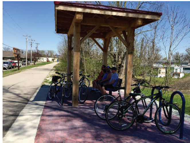
Figure 7: Shelter on the Nickel Plate Trail in Peru