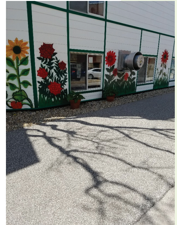
Figure 15: Trailside Restaurant Window on the B-Line Trail