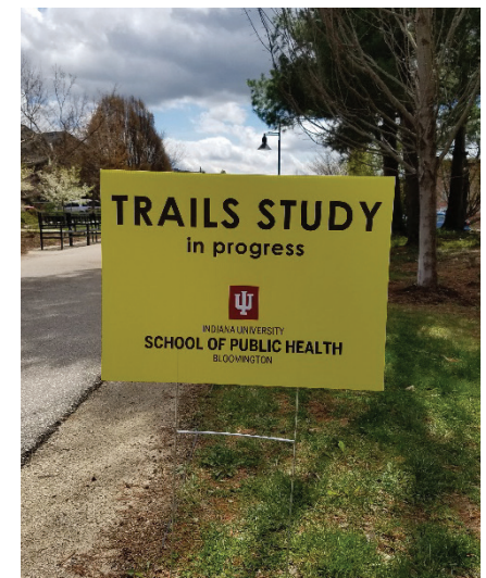
Figure 3: Trail Survey Location on B-Line Trail