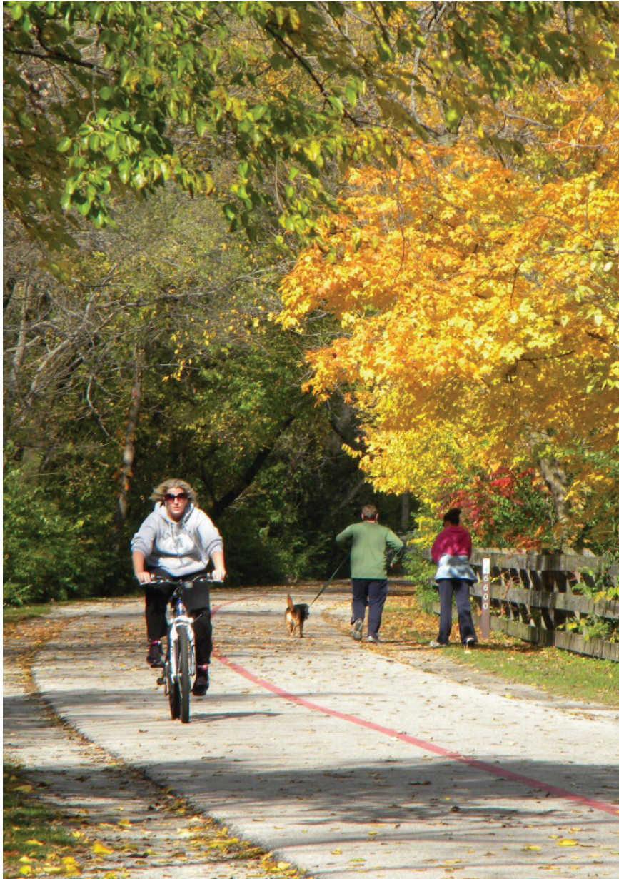
Figure 12: Monon Trail in Indianapolis

All trails participating in the study were asked to place counters on their trails to collect data on trail usage. The preferred counter locations were at or near the trailheads or stations where study volunteers who were recruiting trail users to take the study survey were located in order to most closely correspond counter data with survey data. Most trails were able to place counters in these locations but some were not. Bloomington (B-Line Trail), for example, uses a type of counter that is embedded in the pavement of the trail and was not able to move it near volunteer stations. The counter on the Nickel Plate Trail was placed on the Wabash River Bridge because that location was the most supportive of counter installation but volunteers were not stationed on the bridge.