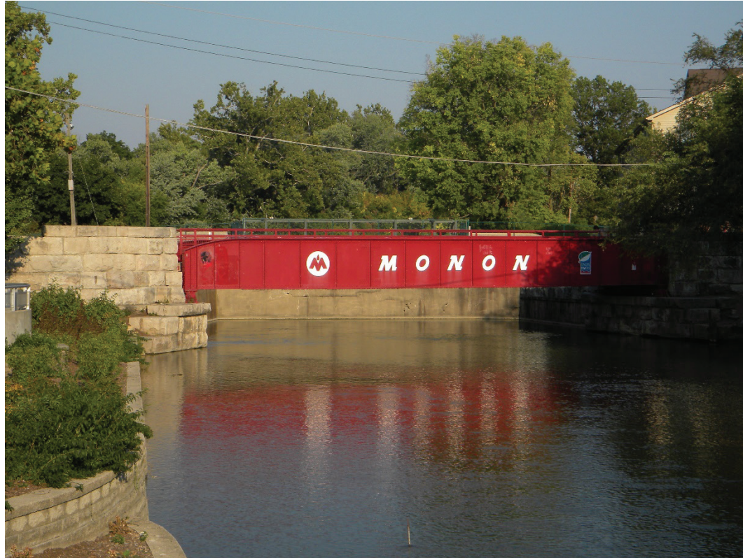
Figure 9: Monon Trail Bridge on the White River in Indianapolis

The biggest concerns trail users have relating to trails (as seen in Tables 20 through 33) are trail maintenance and access to facilities such as restrooms and water fountains. 18% of respondents on average indicated these as their primary concerns. Safety and congestion on the trail (11% each) were the next two concerns reported by trail users. In fact, the top two concerns are the two most common concerns on every trail except the B-Line in Bloomington where safety was rated well above the other trails at 18.5%, followed by congestion (14.5%). This may be related in some ways to two unique characteristics of the B-Line Trail; it is the only trail of the eight (8) in the study to have night lighting for its entire length and is most centrally located. In 2001, the top concerns were the availability of restrooms and drinking fountains and adequate safety patrols.