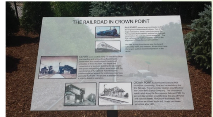
Figure 18: Interpretive Panel on the Erie Lackawanna Trail

As the Indiana Trails Study and many other studies have shown, physical activity is increased when neighborhood residents have access to trails (Richardson, Pearce, Mitchell, & Kingham, 2013). Over 80% of respondents in the Trail Neighbor survey indicated that they use their neighboring trail, confirming that those who live in close proximity to and have easy access to trails are more likely to use them. Sometimes trail corridors are available that are convenient but planners of community trail networks should also intentionally seek out trail routes because of their effectiveness as well.