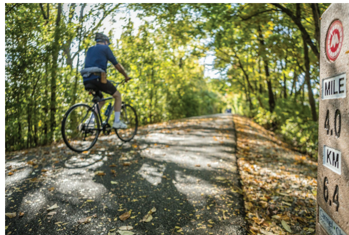
Figure 6: Monon Trail in Carmel

Fifty-five percent of survey respondents reported participating in a second activity on the trail. Tables 4 and 5 show that walking, biking, and running/jogging were again the top three responses with walking being the most common secondary activity. Users spent an average of two days a week on those activities, averaging 71-minute sessions and more than four miles of distance.