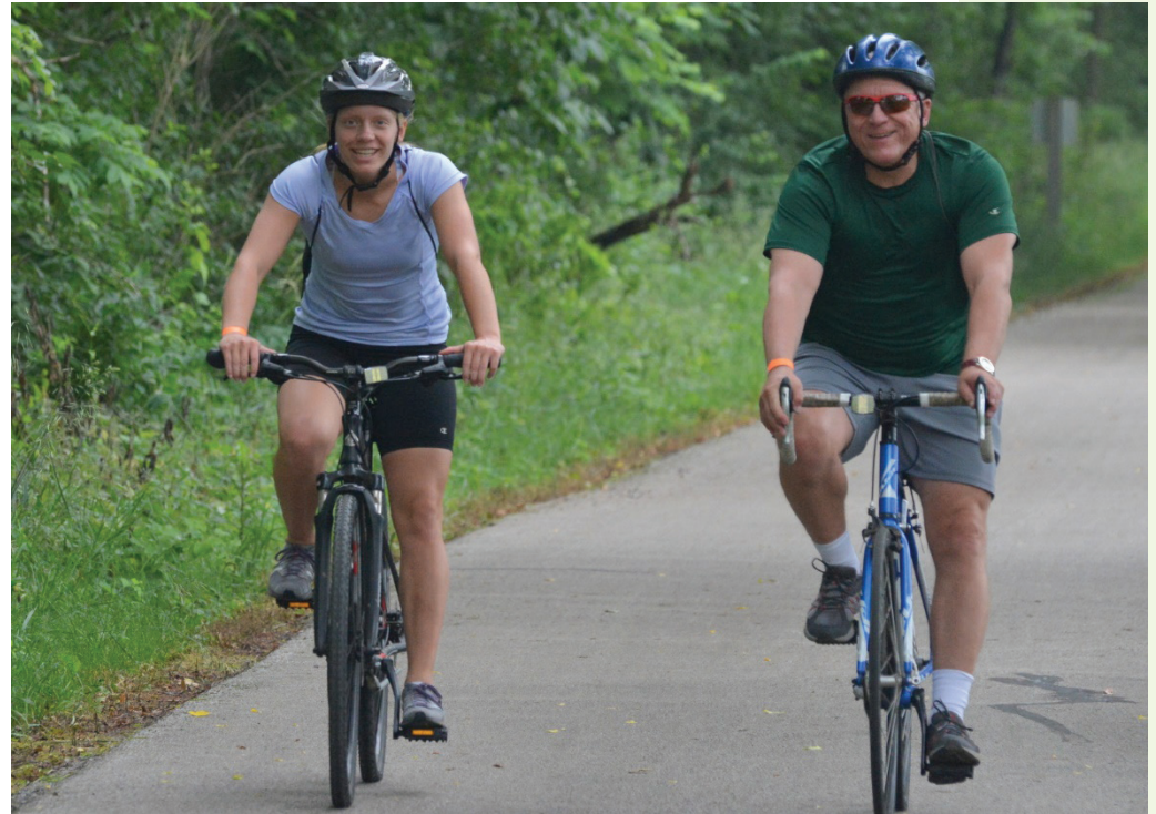
Figure 5: Bikers on the Pumpkinvine Nature Trail

A striking exception to average use is seen on the Columbus People Trail. Fifty-seven percent report that walking is their primary activity and only 27% primarily bike. The three rural trails- Pumpkinvine, Nickel Plate, and Cardinal see the highest levels of biking as the primary use with 72%, 59%, and 66% respectively.