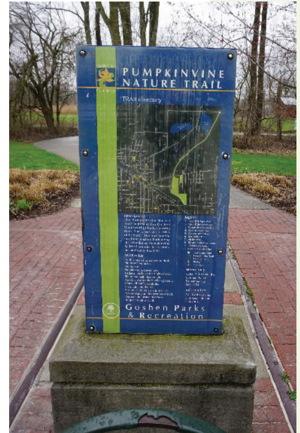
Figure 11: Trail Map of the Pumpkinvine in Abshire Park, Goshen

Comparing the results from Columbus with the B-Line in Bloomington and the Monon, where there are heavy retail environments at or near the trail and heavier spending on food and beverage, communities may be able to see a stronger economic impact from trail be routing them as close to retail business zones as possible and encouraging retail development near trails, bringing trail users and beneficiary businesses closer together. With $1678 spent on food and beverages statewide, almost $1000 on transportation, and the large number of people traveling longer distances to use trails (as shown in Table 8), trails may be proving their value as tourism draws and as economic engine.