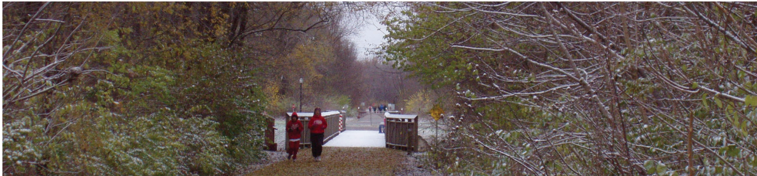
Figure 17: Spring snow on Cardinal Trail