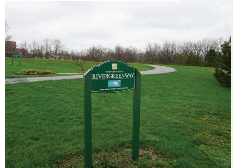
Figure 4: Ft. Wayne Rivergreenway at Ewing St.