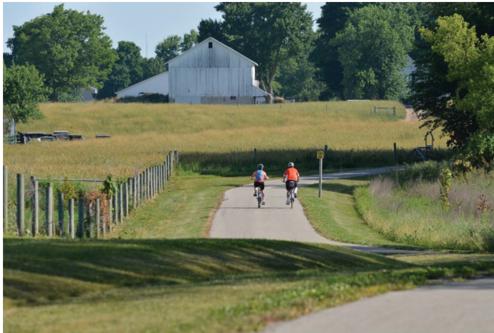
Figure 13: Biking in the Countryside on the Pumpkinvine

Trail users also rate their overall level of health more highly (Table 49) than people who do not use trails. This holds true on every trail surveyed.