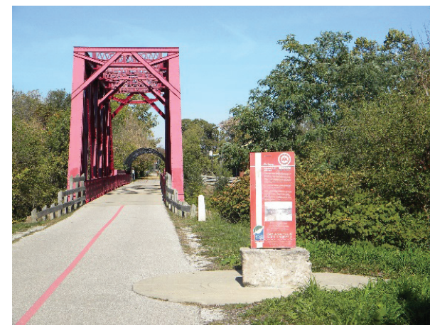
Figure 14: Monon Trail Bridge in Indianapolis